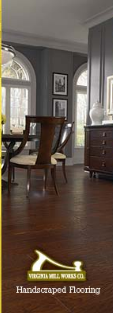
VIRGINIA MILL WORKS CO. Handscraped Flooring