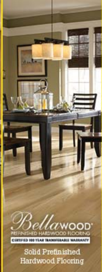
BellaWOOD PREFINISHED HARDWOOD FLOORING CERTIFIED 100 YEAR TRANSFERABLE WARRANTY Solid Prefinished Hardwood Flooring