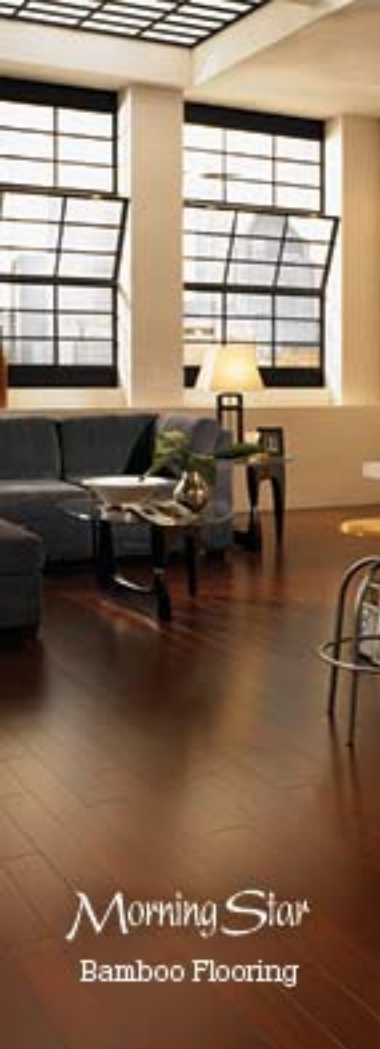
Morning Star Bamboo Flooring